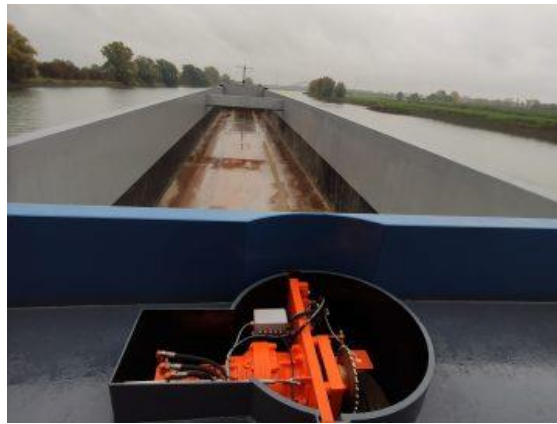
Spudpole for comfort in dokking